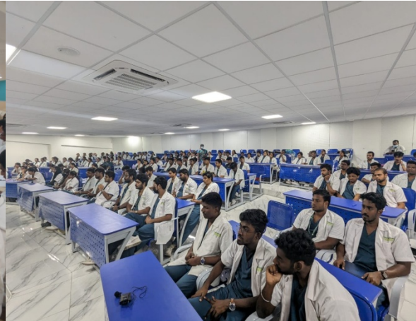
Panimalar Medical College,Chennai