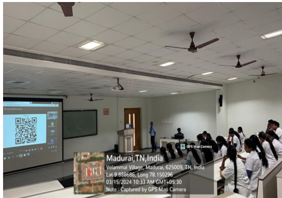
Velammal Medical College, Madurai