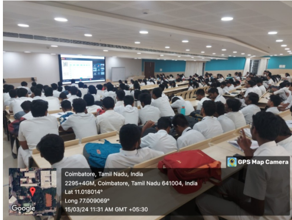
PSG Medical College ,Coimbatore