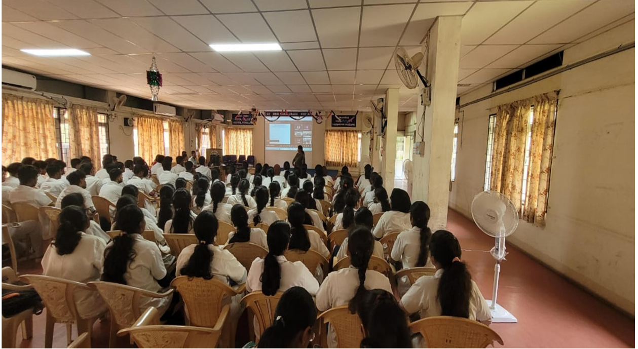
Government Vellore Medical College